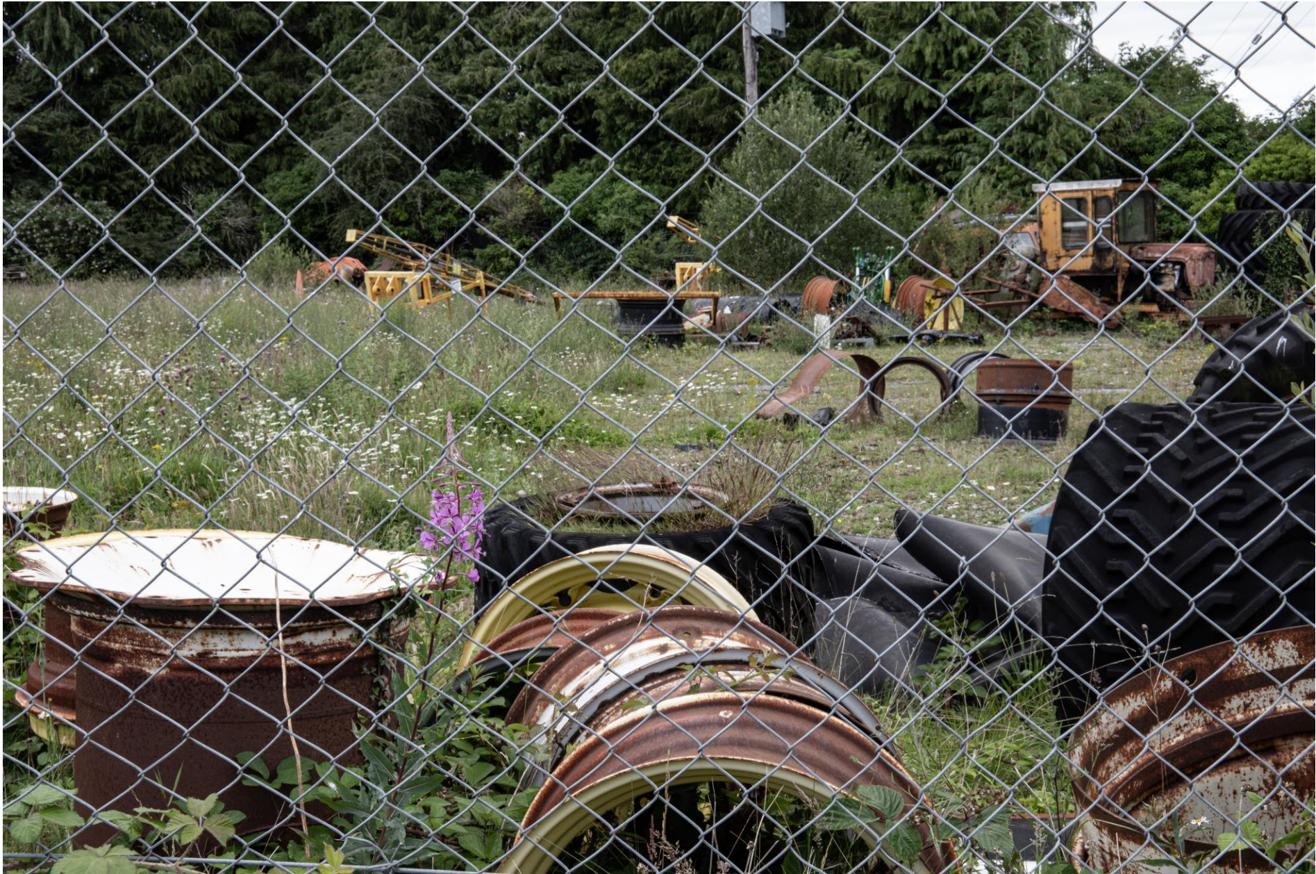
Fig. 12 Moylan L.