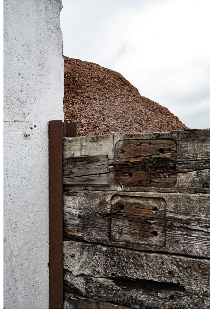
Fig. 4 Moylan L. Untitled