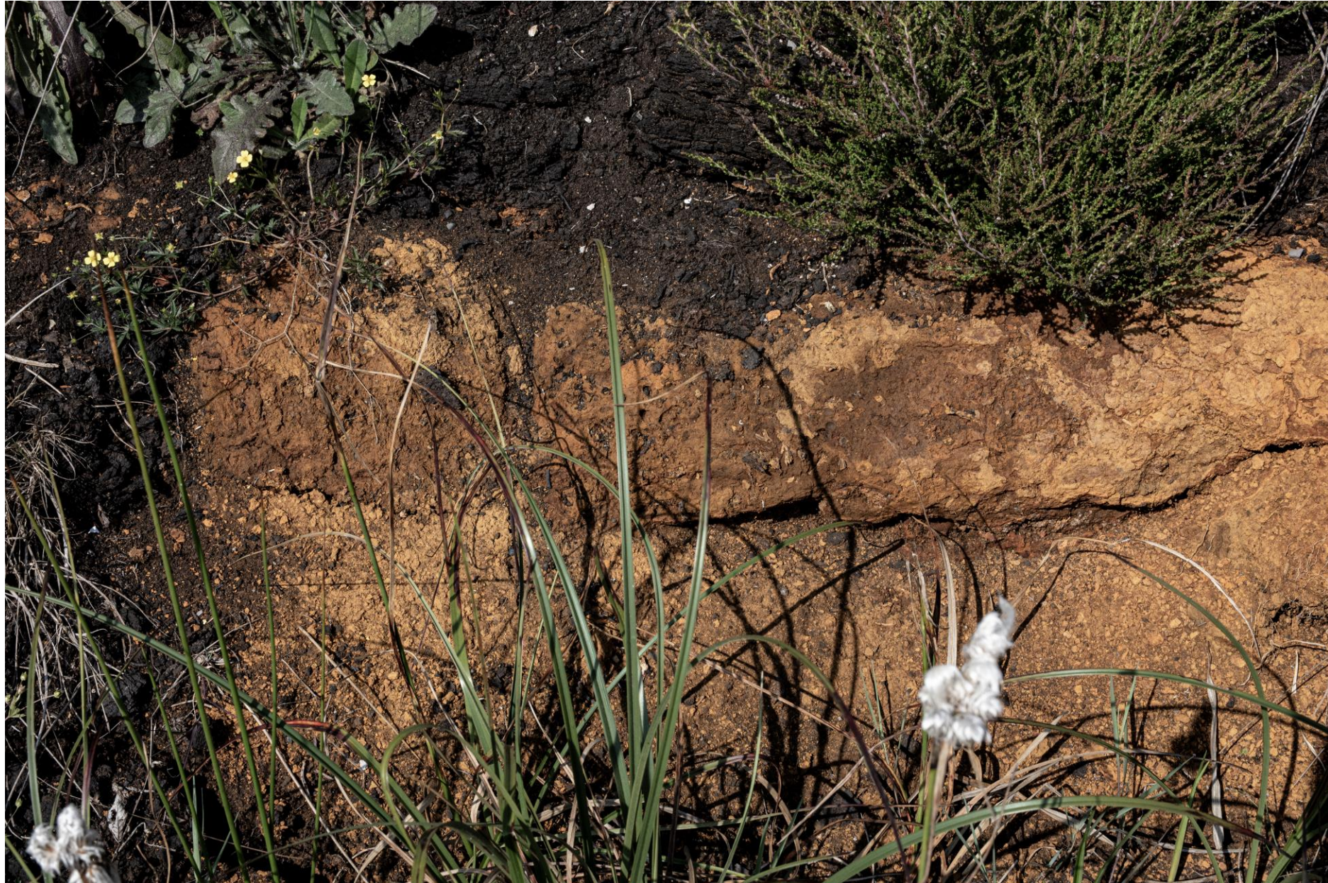
Fig. 9 Moylan L.