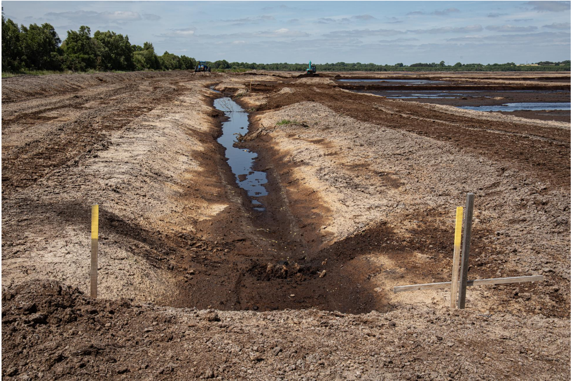
Fig. 15 Moylan L.