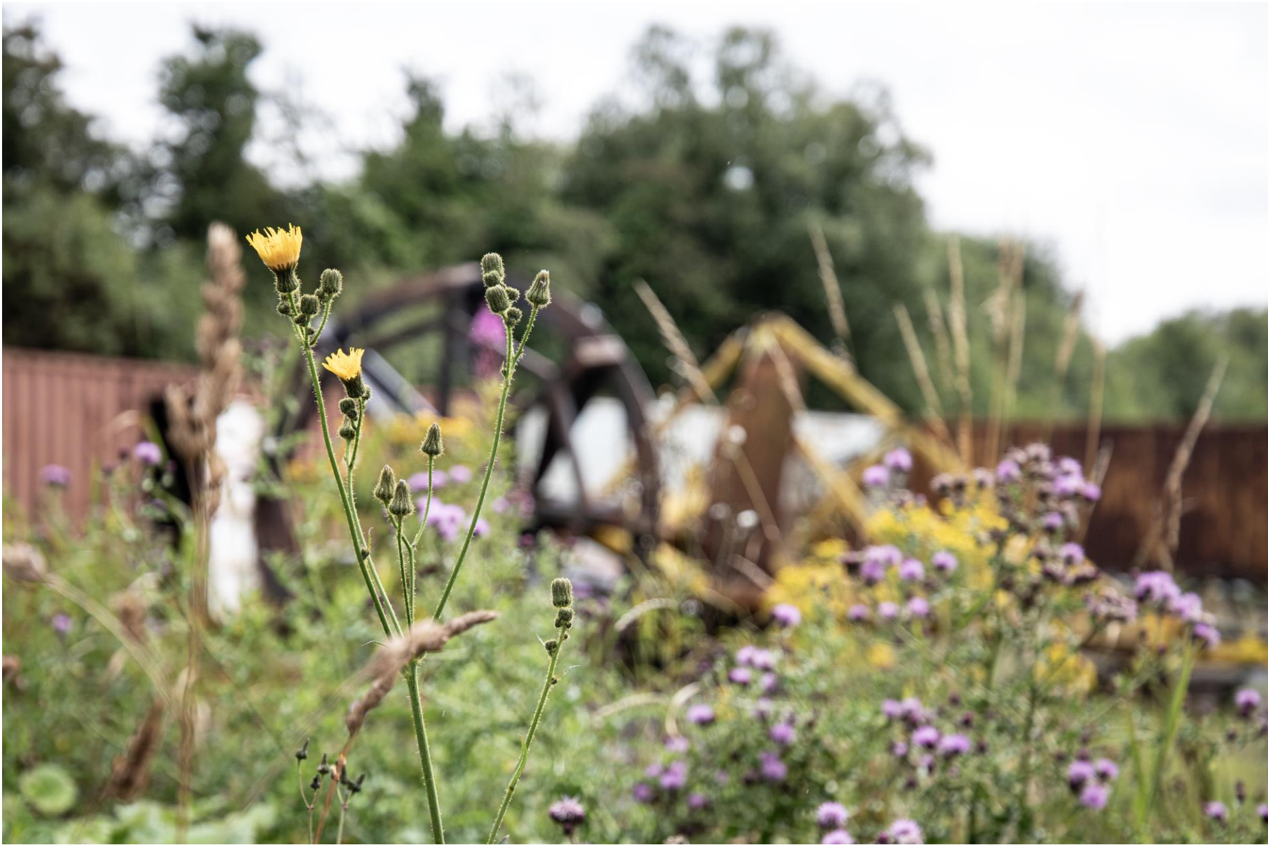
Fig. 11 Moylan L.