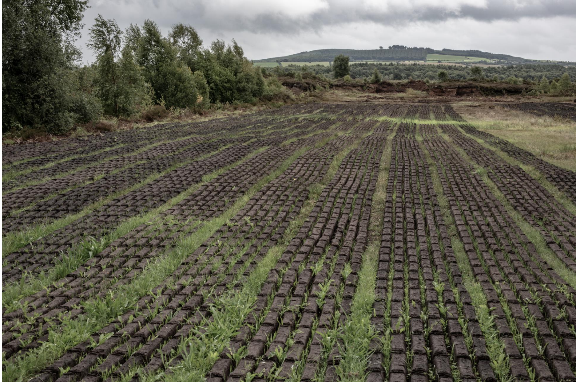
Fig. 8 Moylan L.