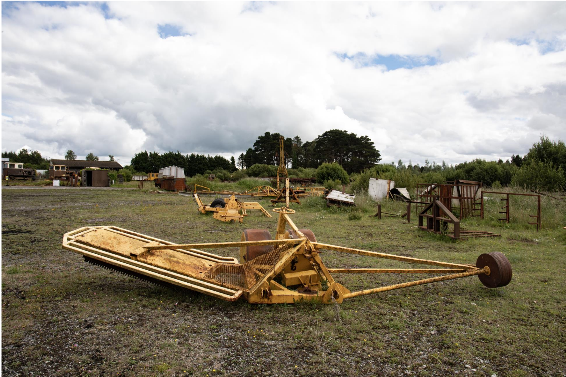
Fig. 10 Moylan L.