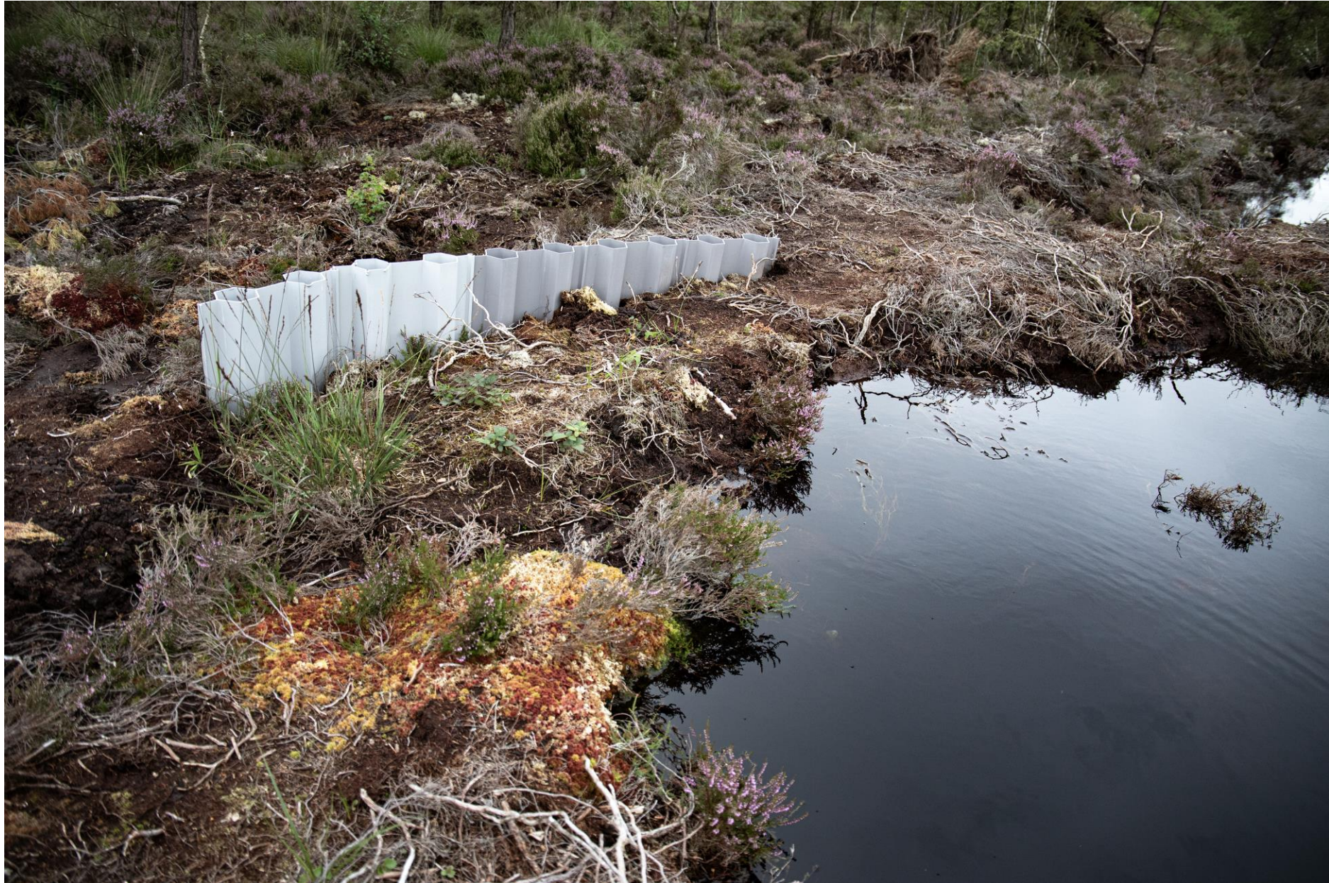
Fig. 16 Moylan L.