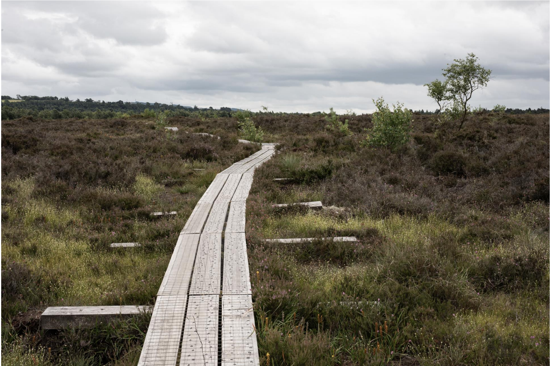
Fig. 18 Moylan L.