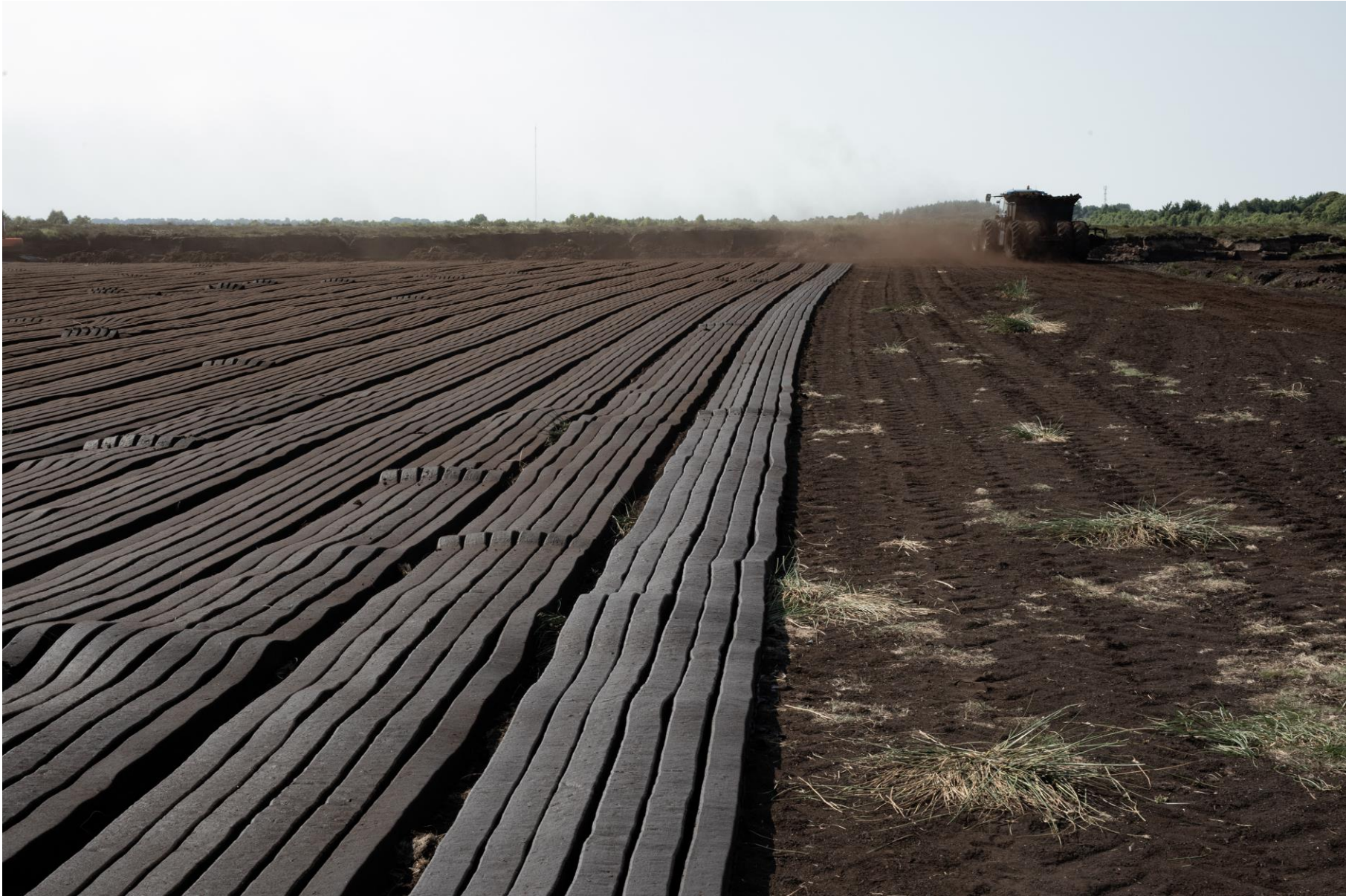
Fig. 7 Moylan L.