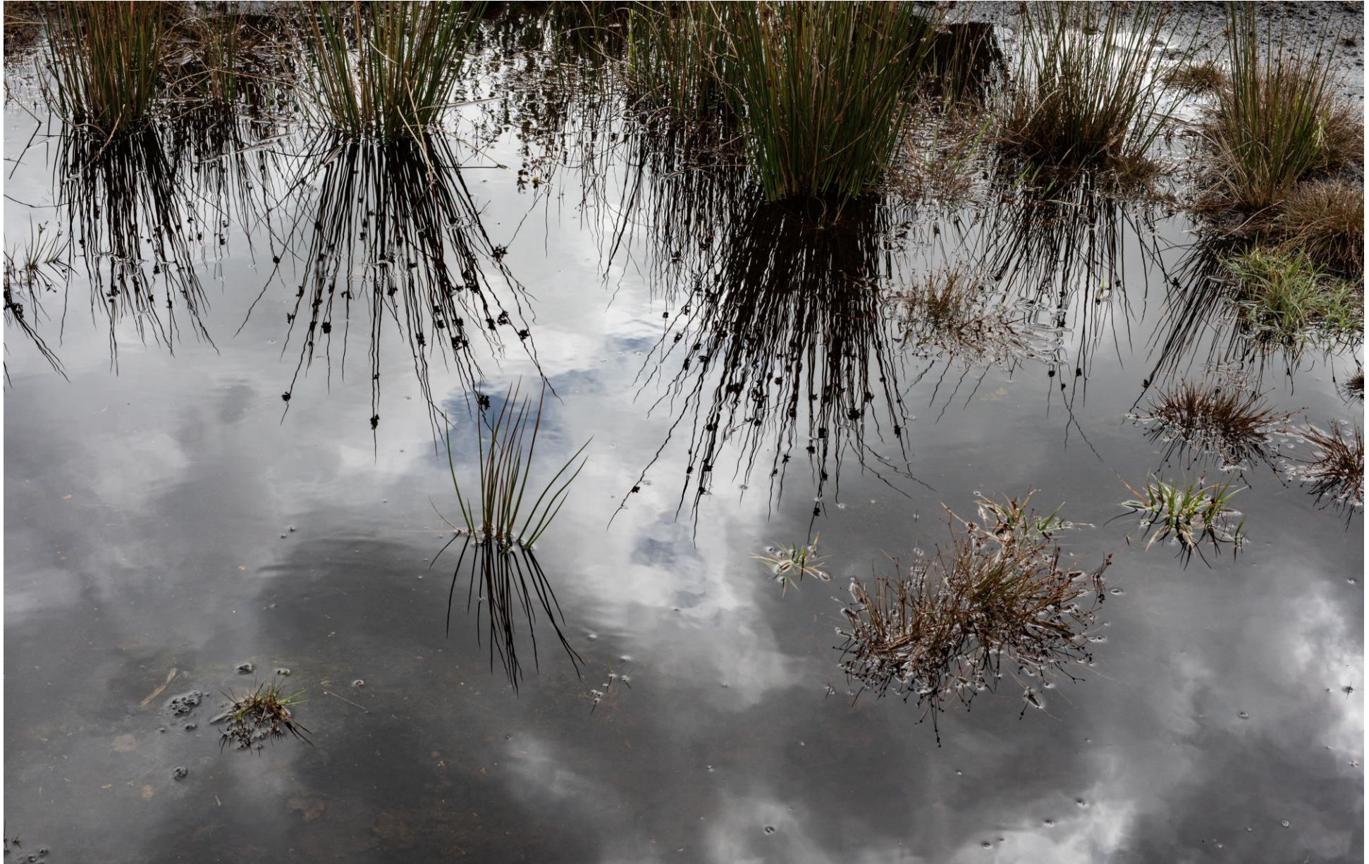
Fig. 17 Moylan L.