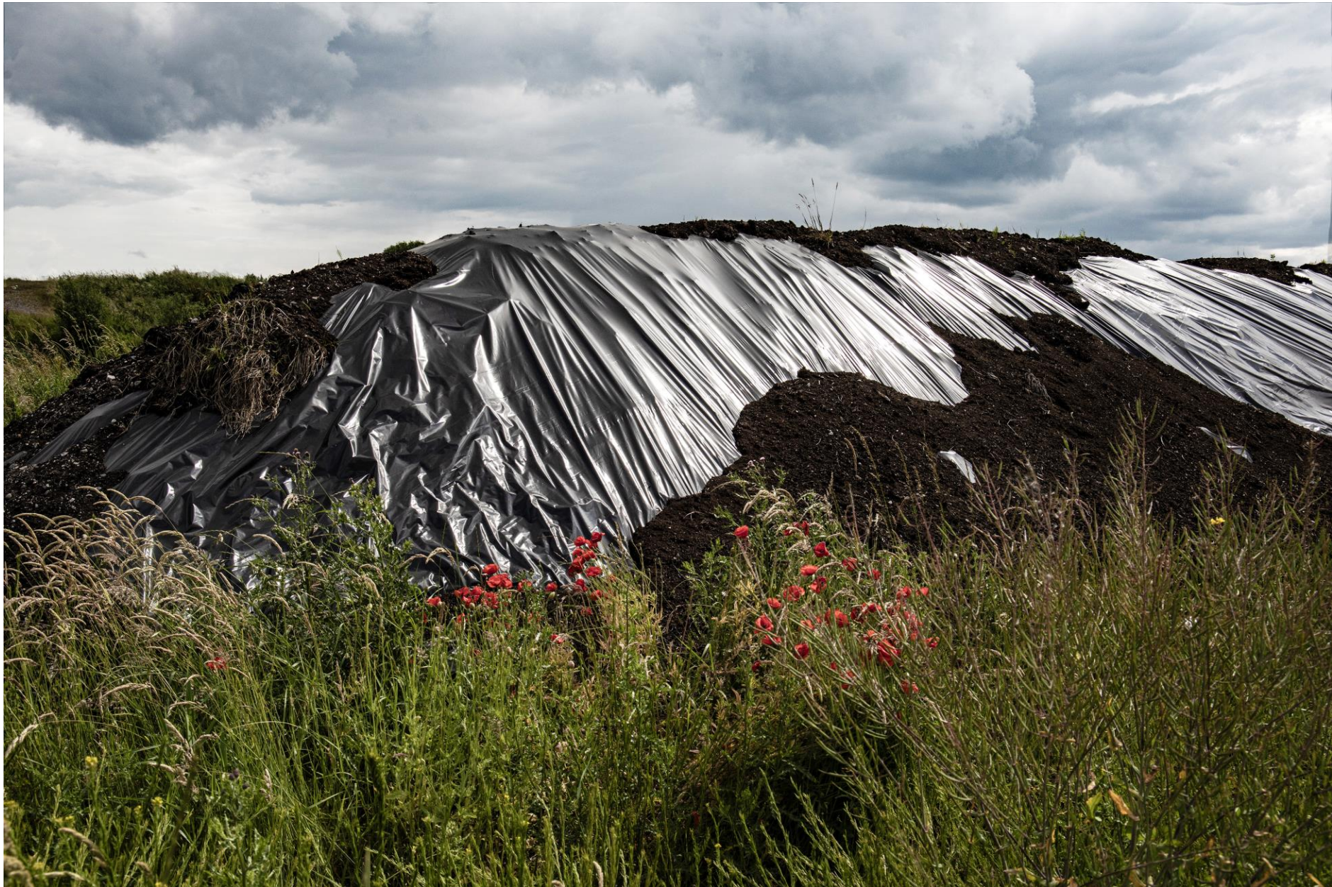
Fig. 2 Moylan L.