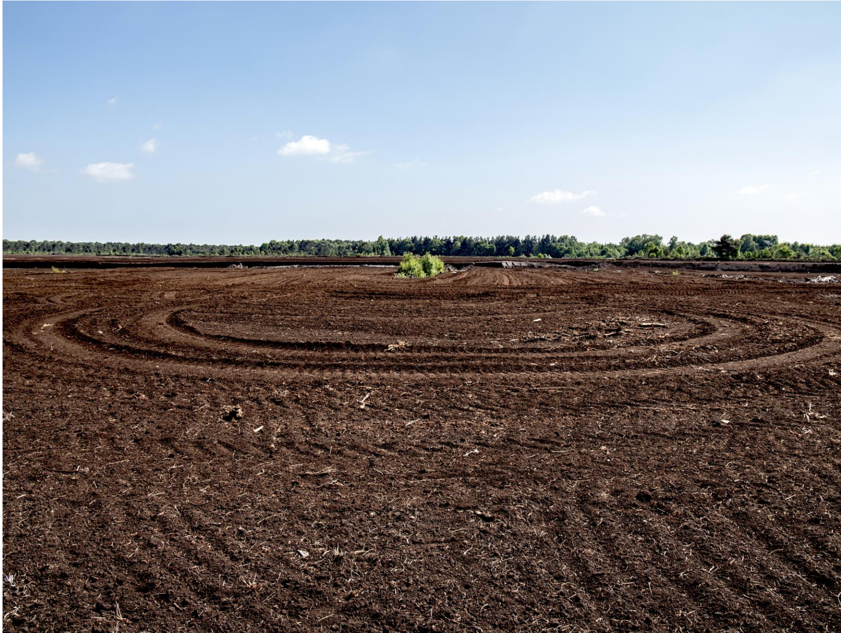
Fig. 6 Moylan L.