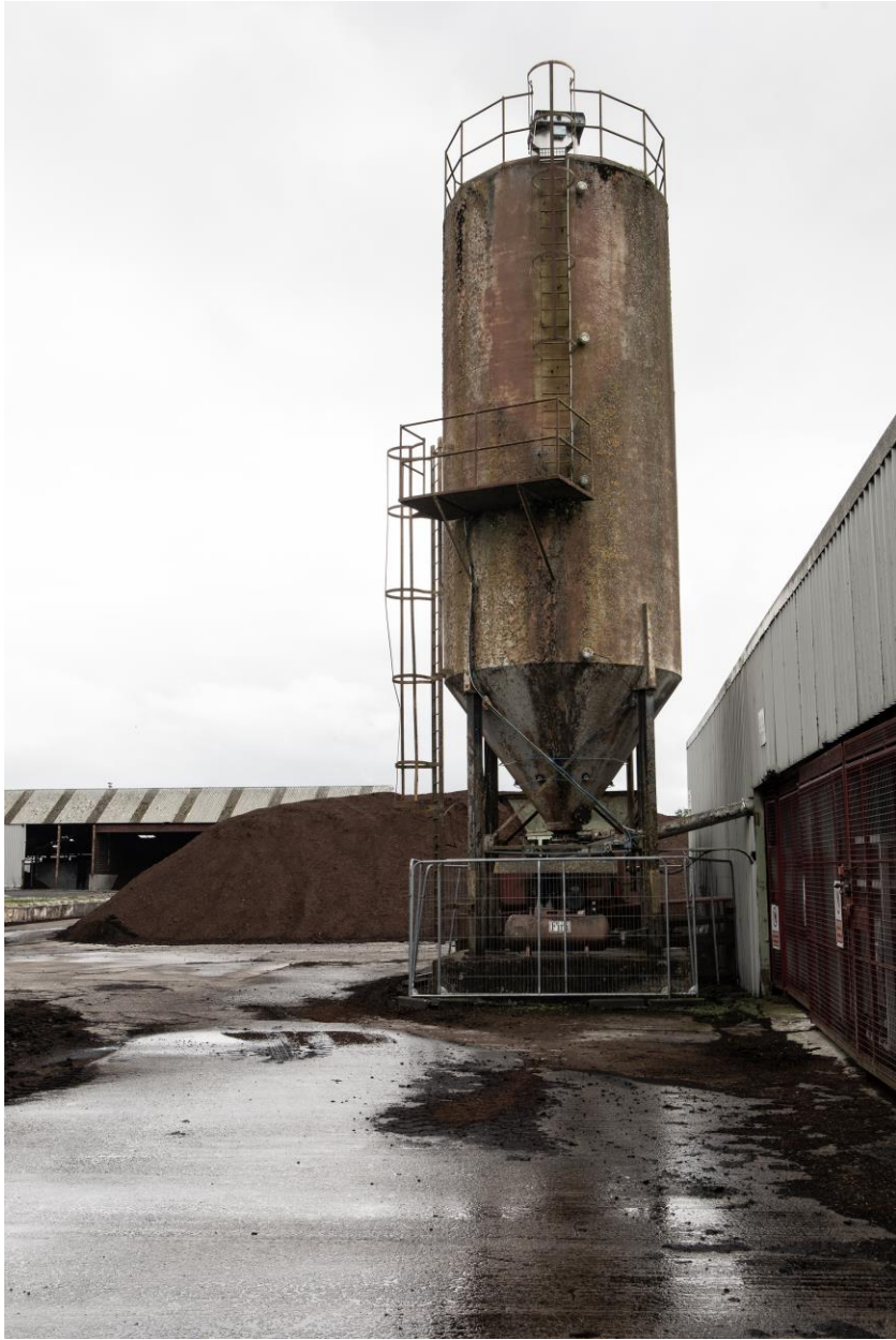
Fig. 3 Moylan L. Untitled