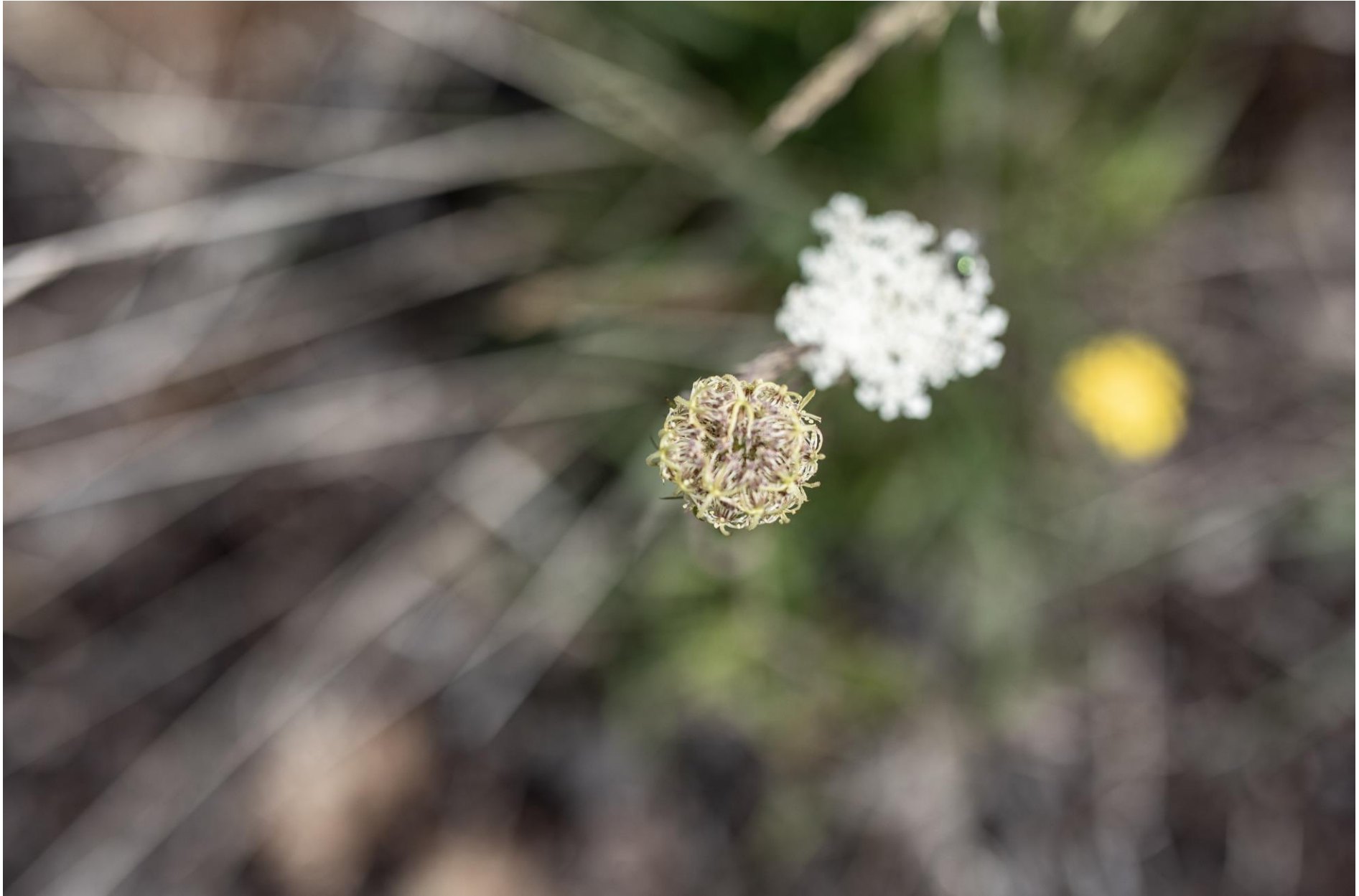
Fig. 19 Moylan L.