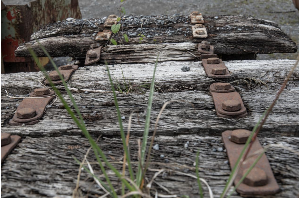
Fig. 13 Moylan L.